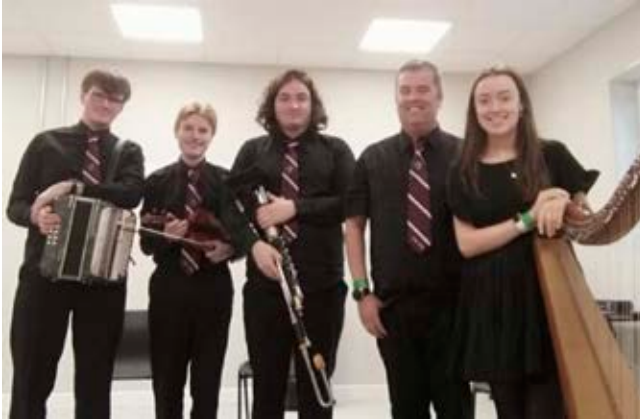
The Kilcavan Team