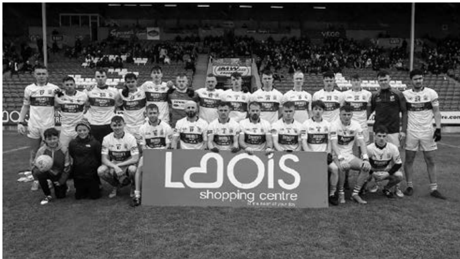
Portlaoise - Laois Shopping Centre Junior Football Champions 2022