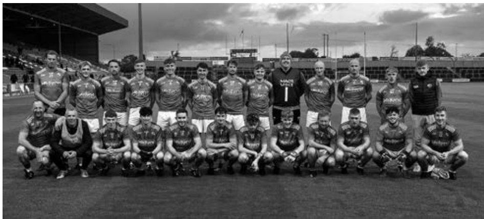
Rathdowney - Laois Shopping Centre Junior "C" Football Champions 2022