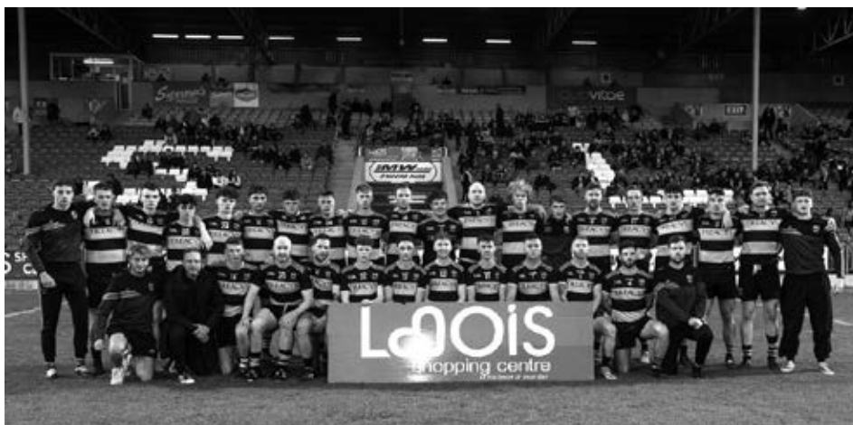
The Heath - Laois Shopping Centre Intermediate Football Champions 2022