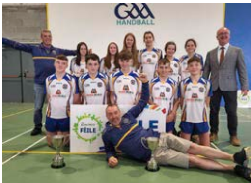
Girls' Division 1 Wall-Ball & Boys' Division 1 Wall-Ball Winners Clough-Ballacolla