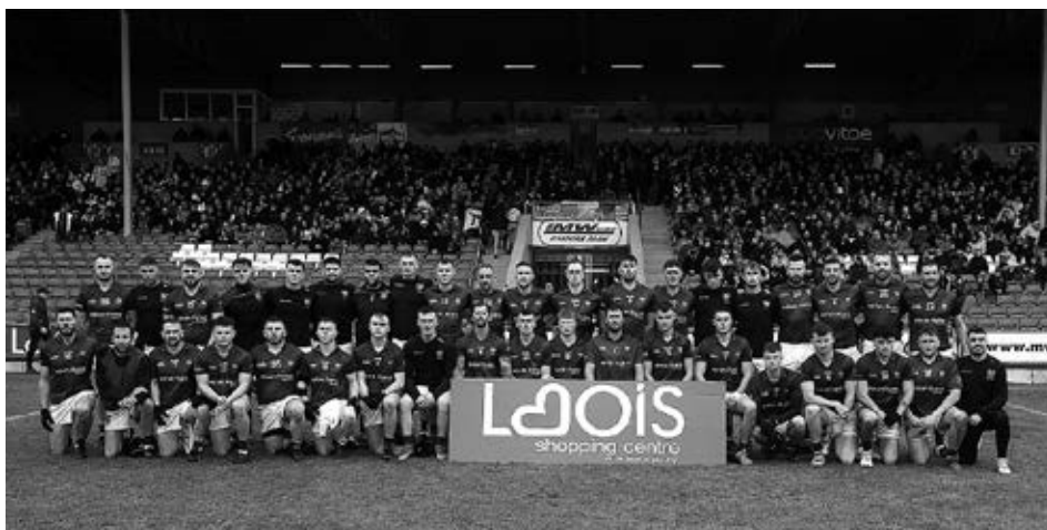
Portarlinton - Laois Shopping Centre Senior Football Champions 2022