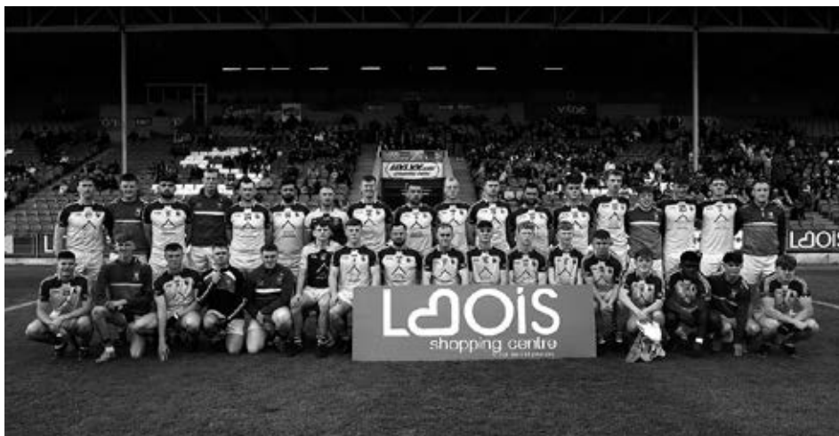
St Lazerians Abbeyleix - Laois Shopping Centre Premier Intermediate Hurling Champions 2022