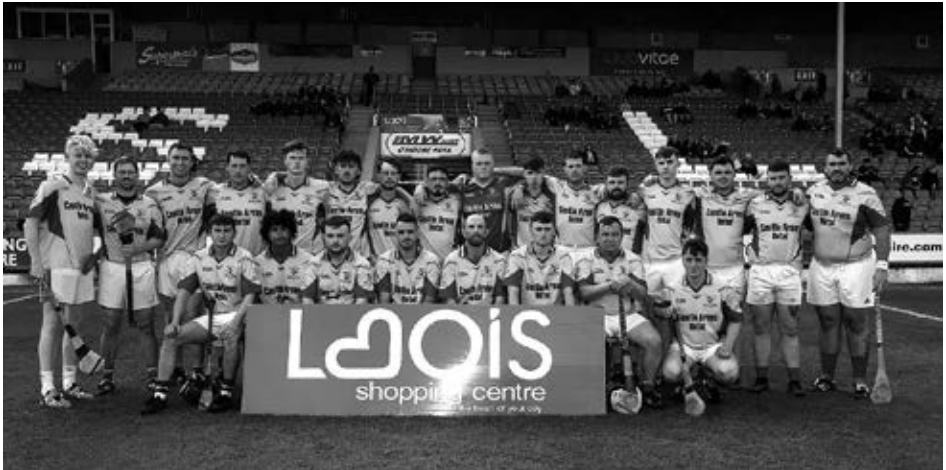
The Harps - Laois Shopping Centre Junior Hurling Champions 2022