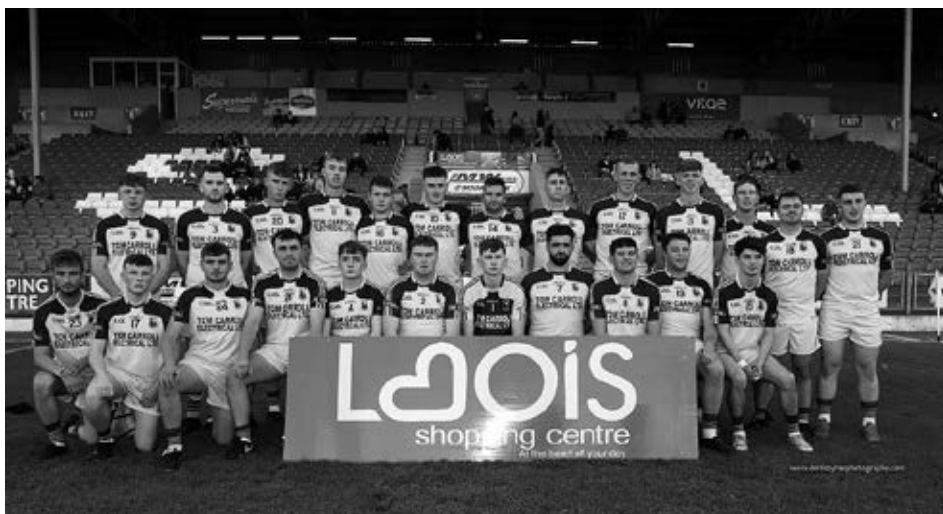
St. Lazerians Abbeyleix - Laois Shopping Centre Junior Hurling Champions 2022