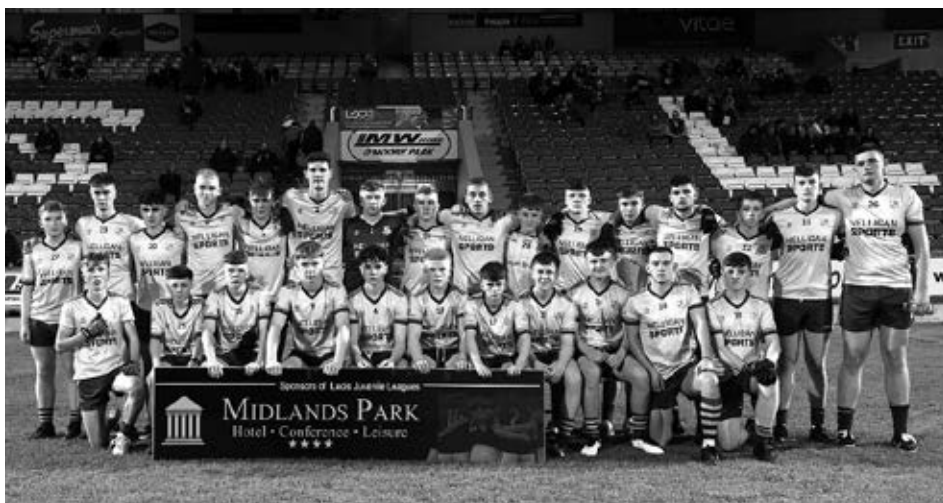
St Joseph's - Midlands Park Hotel Minor Football Champions 2022