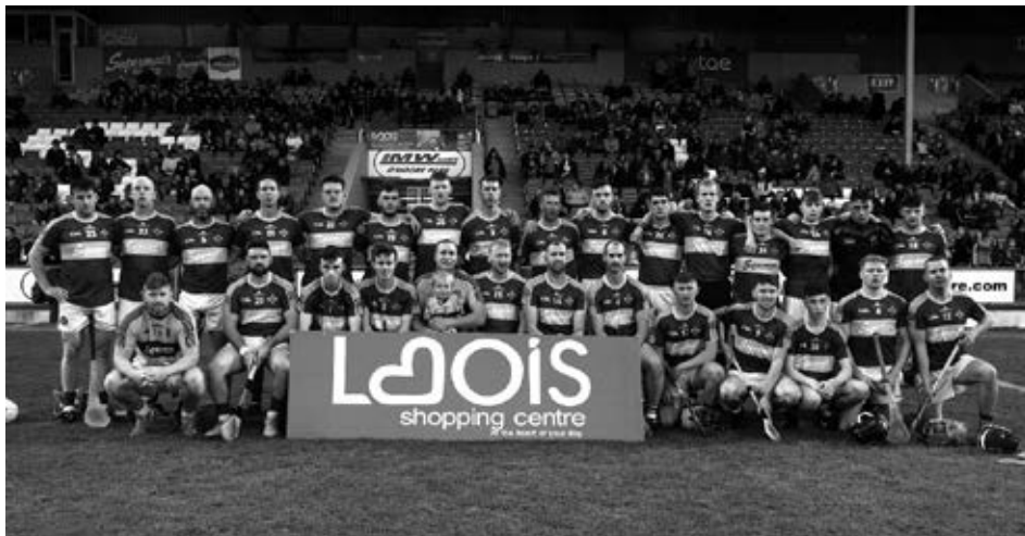
Clough Ballacolla - Laois Shopping Centre Intermediate Hurling Champions 2022