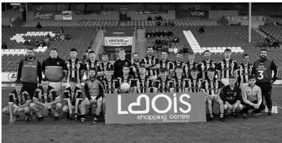
Camross - Laois Shopping Centre Junior Football "B" Champions 2022