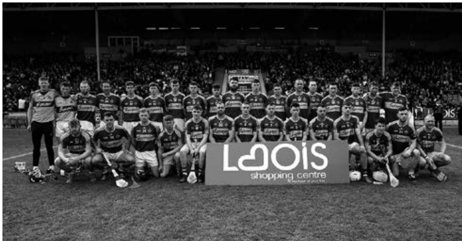
Clough Ballacolla - Laois Shopping Centre Senior Hurling Champions 2022