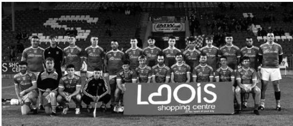
Rosenallis - Laois Shopping Centre Junior "B" Hurling Champions 2022