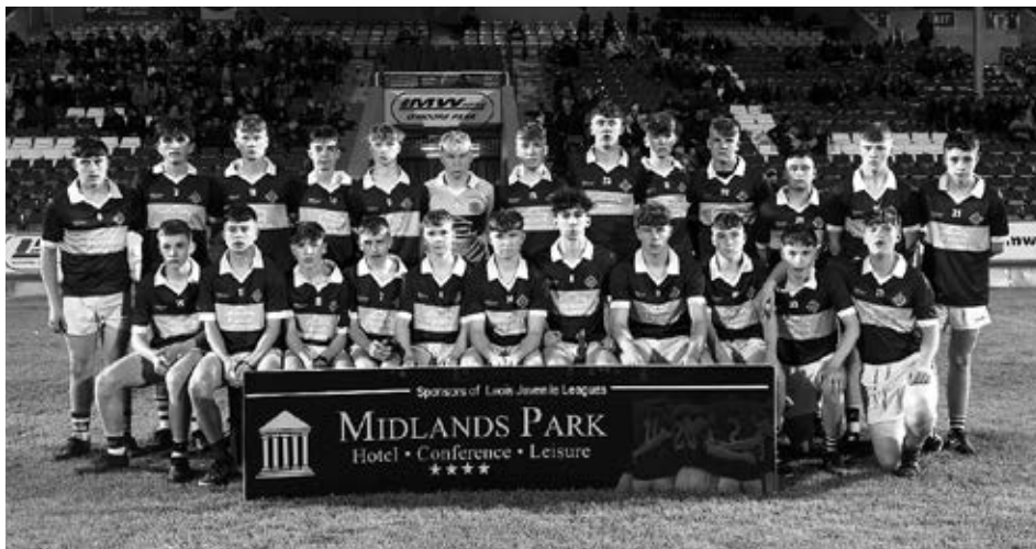
Clough Ballacolla - Midlands Park Hotel Minor Hurling Champions 2022