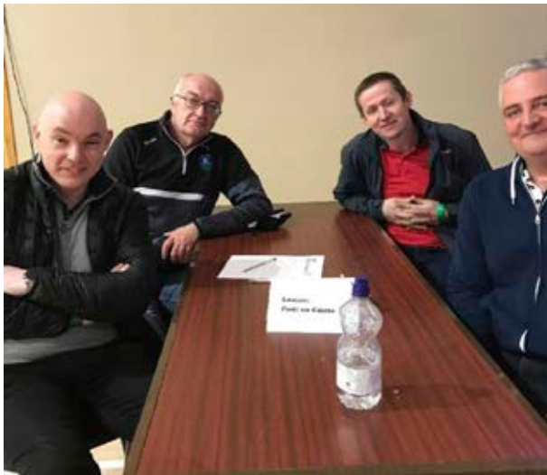
The Courtwood Team