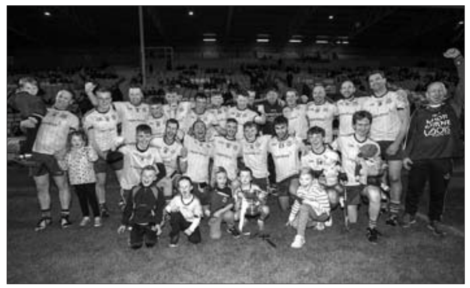
St Joseph's JFC Winners