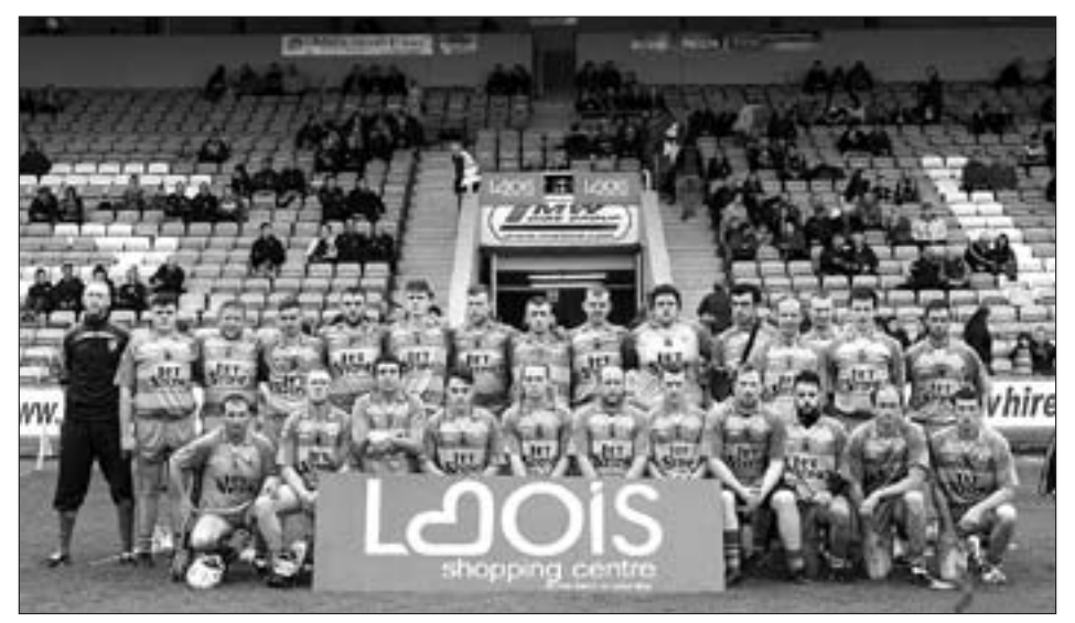
Ballypickas JHC Winners