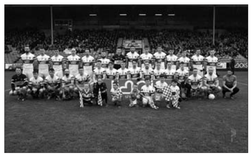
Portlaoise Senior Football Championship 2017 Winners