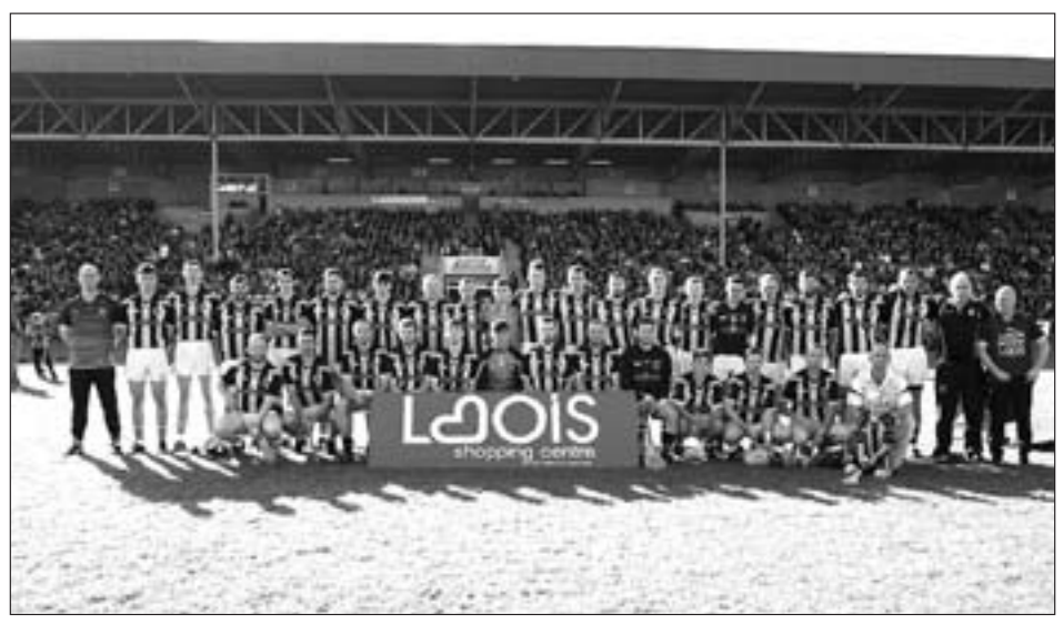
Camross Senior Hurling Championship 2017 Winners