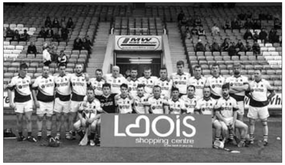
Mountmellick JHC C Winners