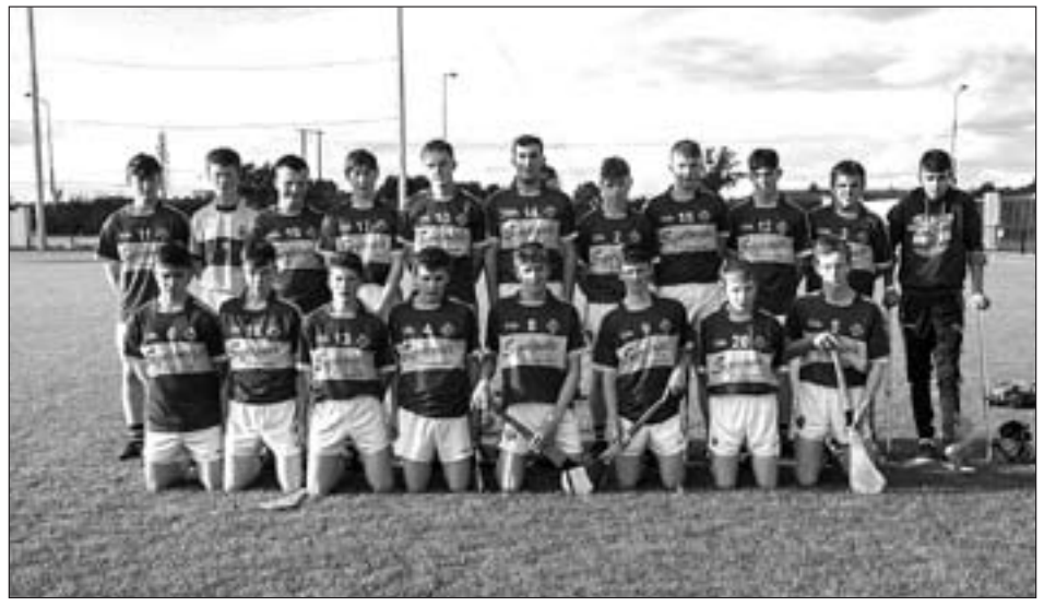
Clough Ballacolla MHC B Winners