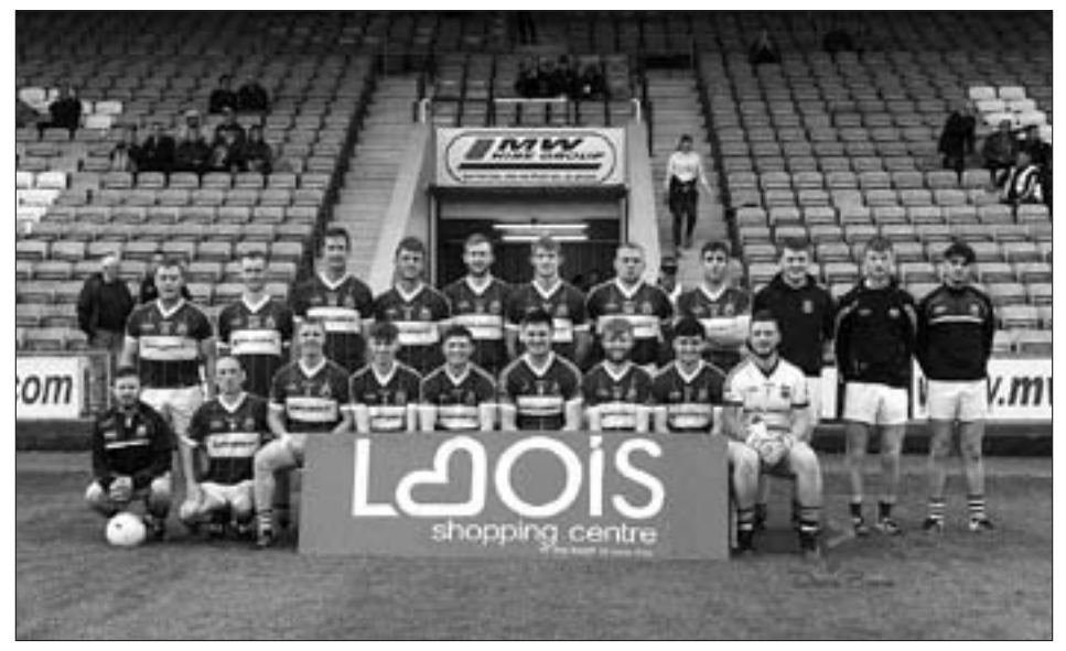
Castletown JFC C Winners