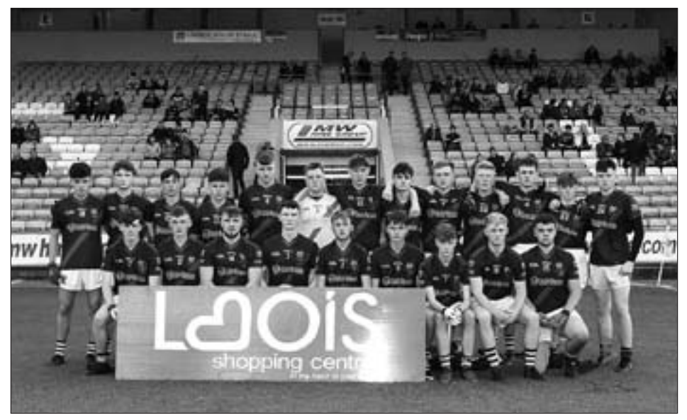
Portarlington MFC Winners