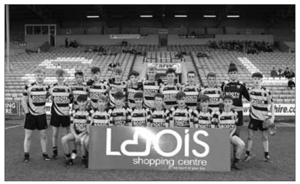
The Heath MFC B Winners