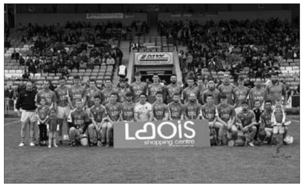
Ballyfin Gaels SHC A Winners