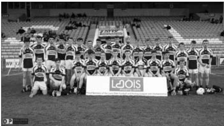
Castletown Slieve Bloom Minor Hurling Champions 2015