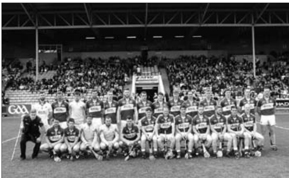
Laois Senior Hurling panel 2015