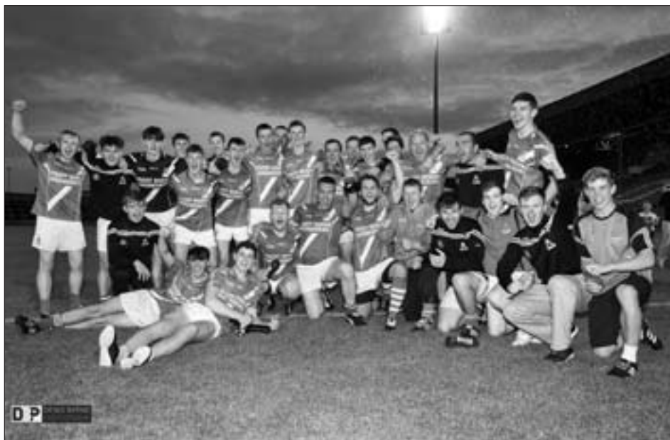
Killeshin Junior Football B Champions 2015