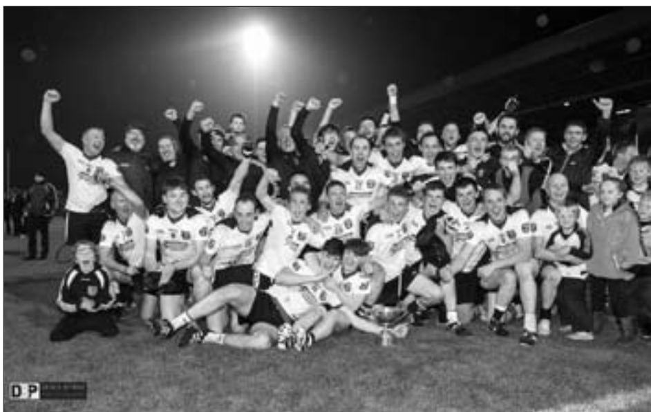
Barrowhouse Junior Football Champions 2015