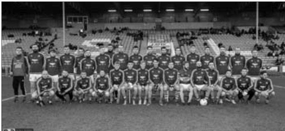
Portlaoise Senior Football Champions 2015