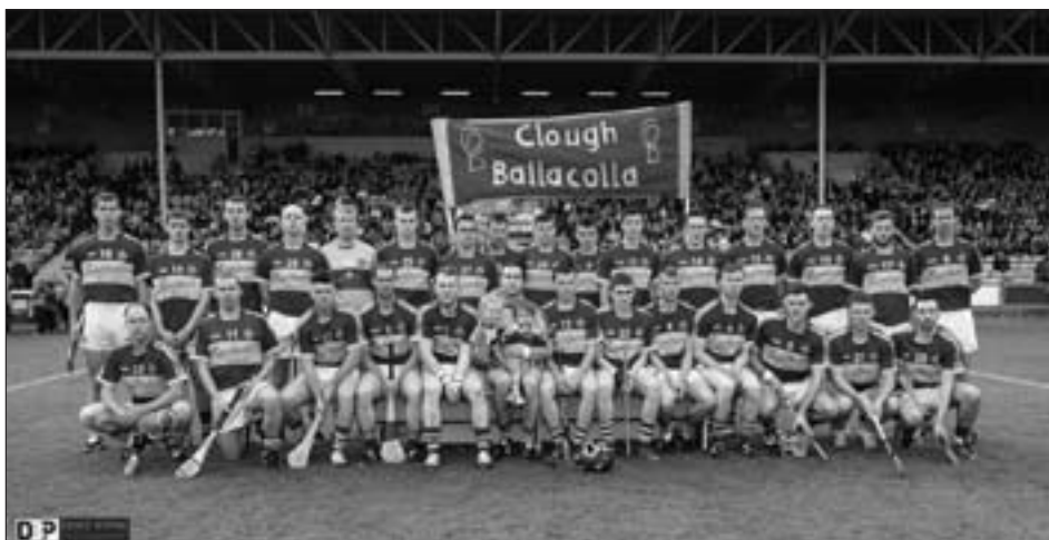
Clough Ballacolla Senior Hurling Champions 2015