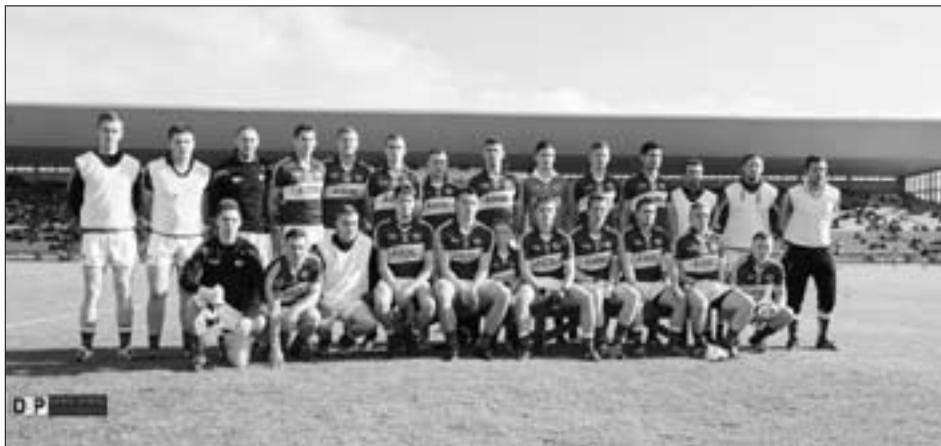
Laois Senior Football panel 2015