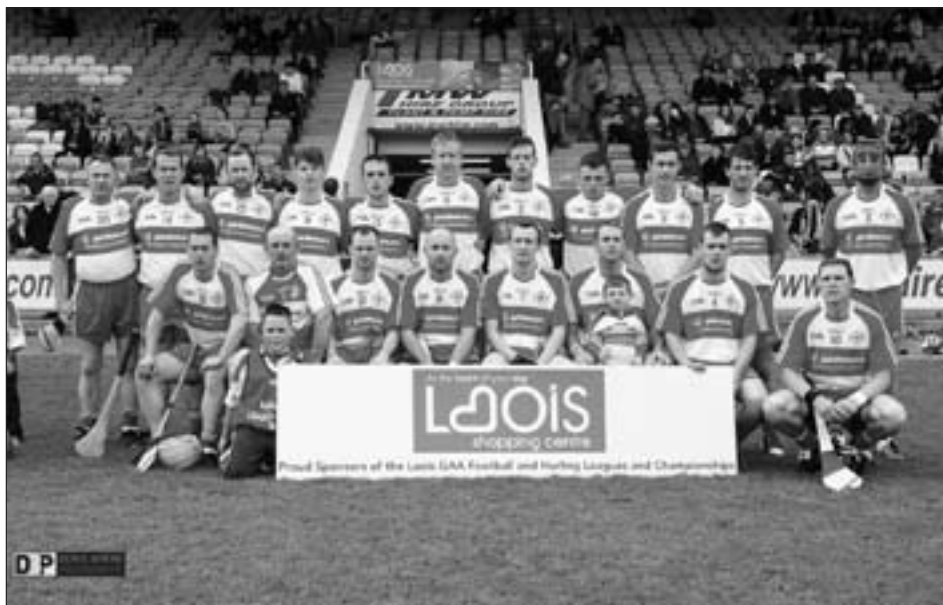
Trumera Intermediate Hurling Champions 2015