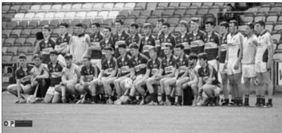
Laois MHC Team 2015