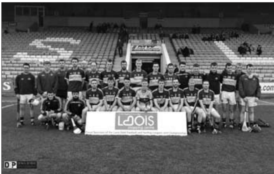
Clough Ballacolla Junior Hurling Champions 2015