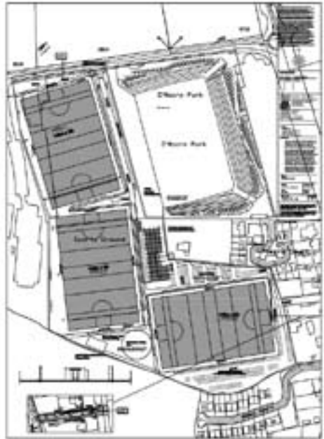
Centre of Excellence Layout