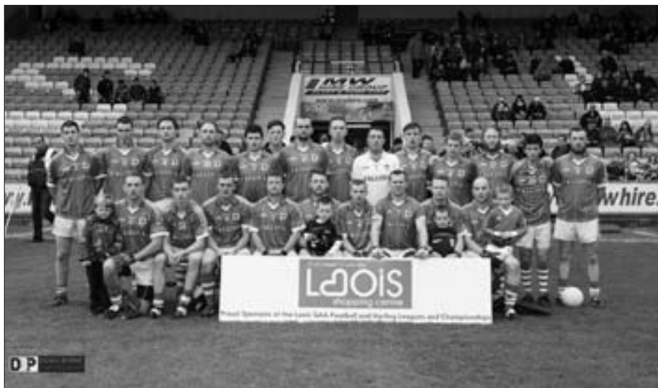
Clonaslee / St. Manmans Intermediate Football Champions