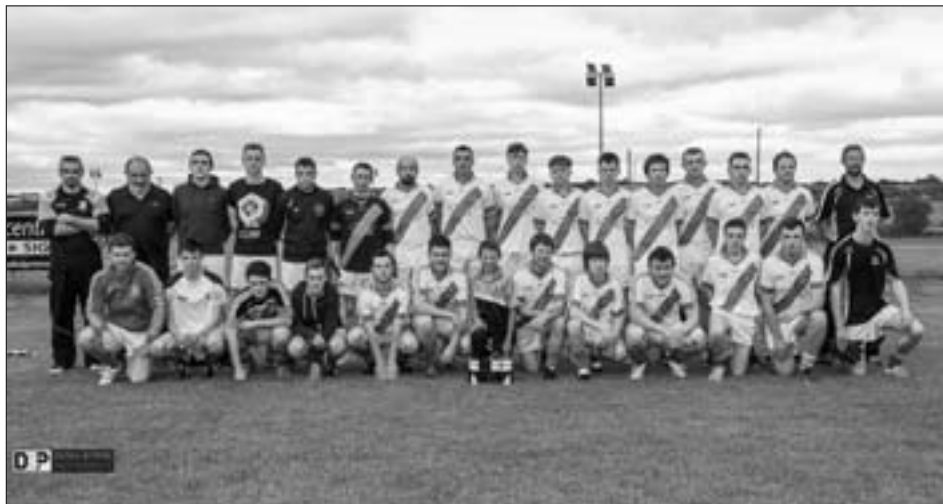
Rosenallis Junior C Football Champions 2015