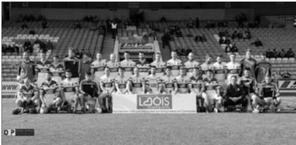
Portlaoise Senior Hurling A Champions 2015