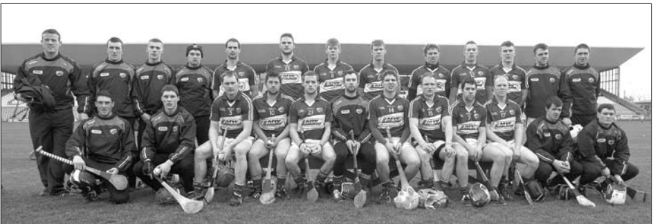
Laois Senior Hurling panel 2014