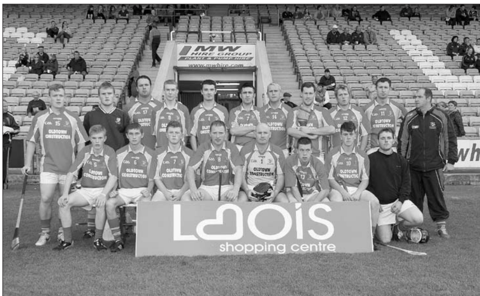
Laois Shopping Centre JHC B Winners The Harps