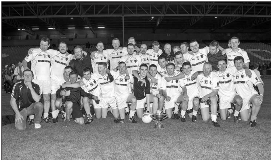
Laois Shopping Centre JFC Winners Courtwood 2014