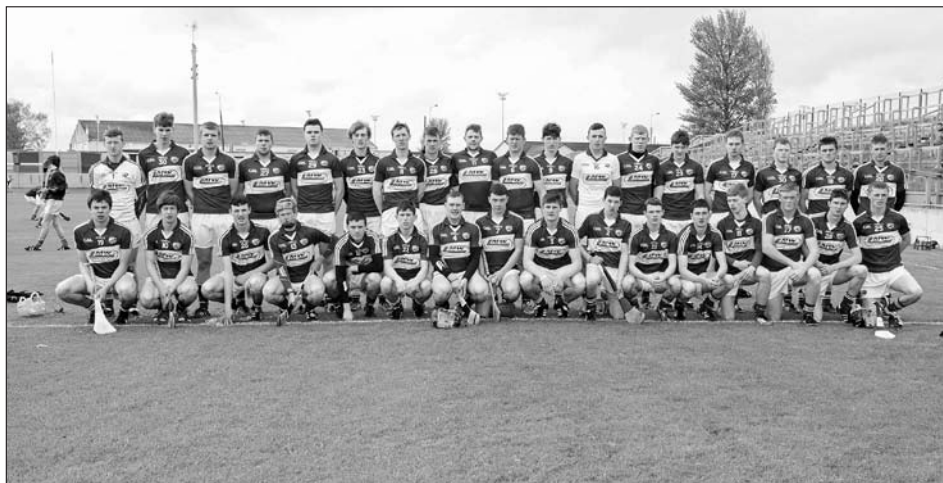
Laois Minor Hurling Panel 2014