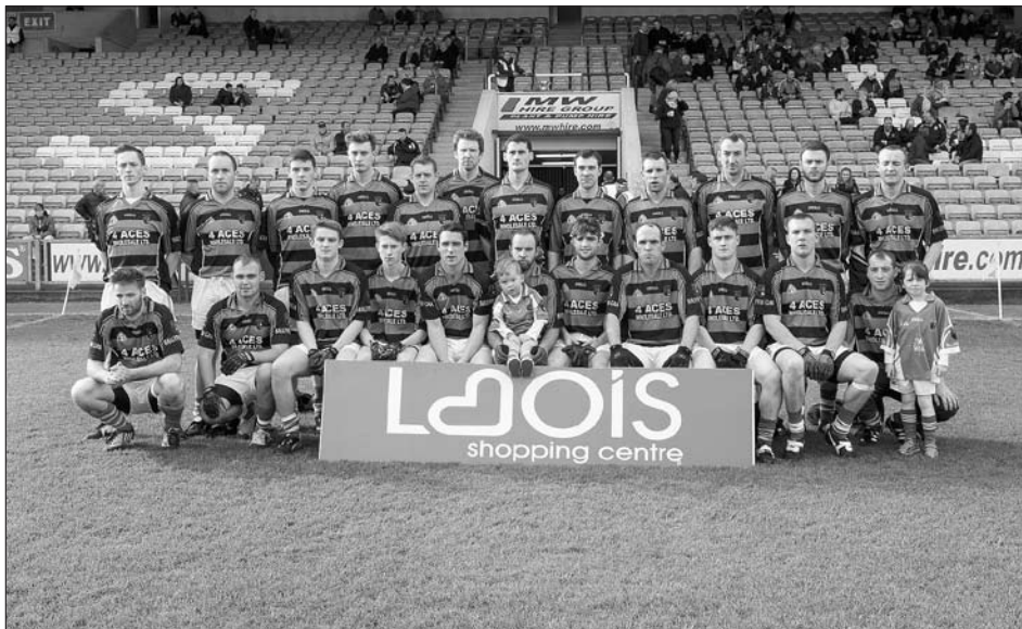
Laois Shopping Centre IFC Winners Ballyfin 2014