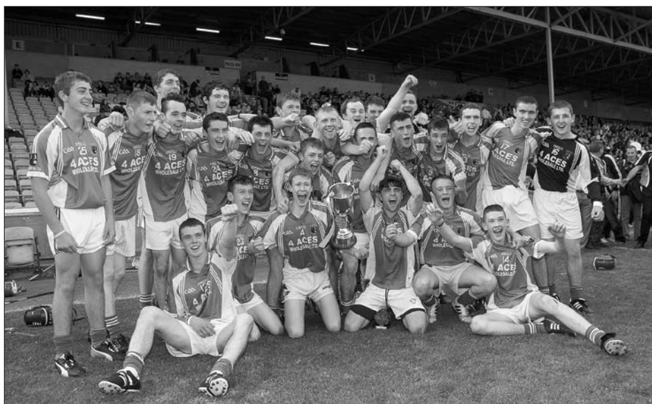
Laois Shopping Centre MHC Winners Na Fianna 2014