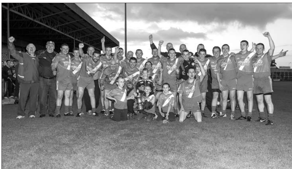
Laois Shopping Centre JHC C Winners Borris-in-Ossory/Kilcotton