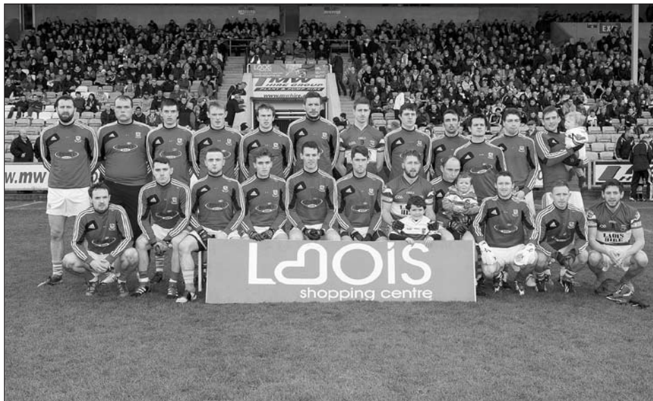
Laois Shopping Centre SFC Winners Portlaoise 2014