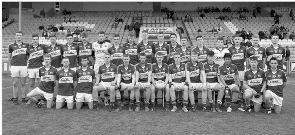
Laois Minor Football Panel 2014