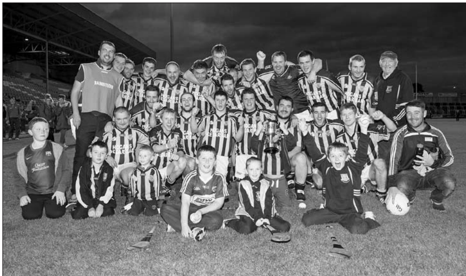
Laois Shopping Centre JFC C Winners Camross Team 2014