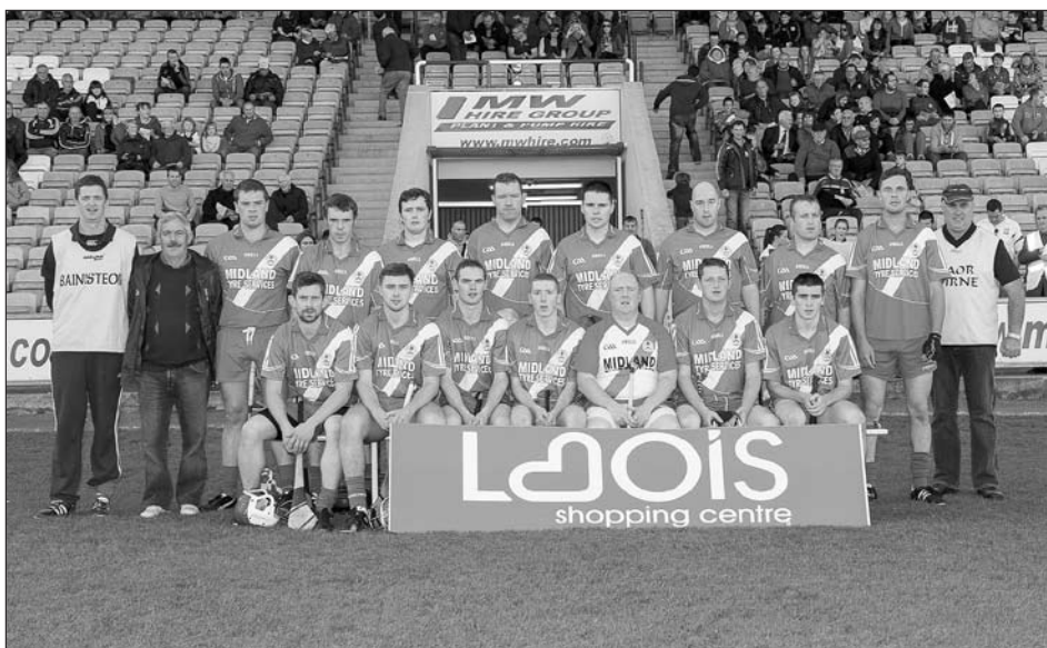
Laois Shopping Centre IHC Winners Borris Kiltcotton 2014