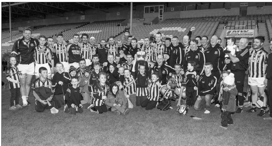
Laois Shopping Centre JHC Winners Camross 2014