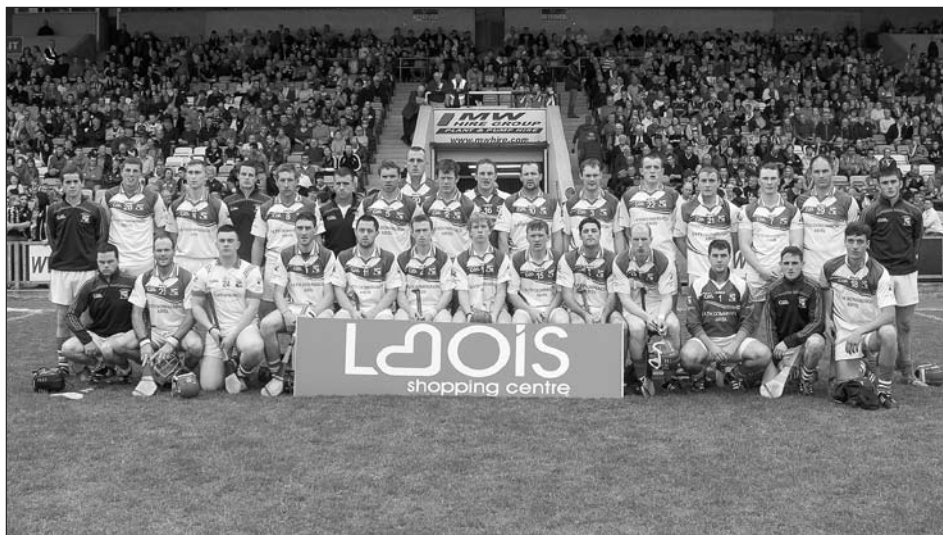
Laois Shopping Centre SHC Winners Rathdowney Errill 2014