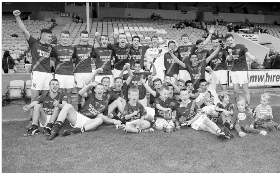
Laois Shopping Centre MFC Winners Portarlington 2014