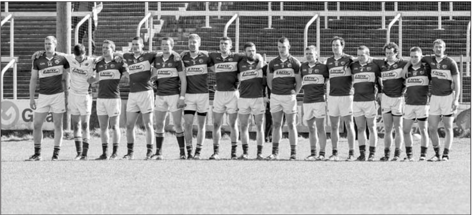
Laois Senior Football panel 2014

Park. Similar to last year, this was again a fabulous performance, passion and pride in the Laois jersey in abundance, only to again heartbreakingly lose out in the closing minutes. Unfortunately our inexperience in failing to shut out the big teams in the closing periods of big games cost us again. In the Qualifier series, we faced a trip to Walsh Park, with Waterford being our opponents. Here we never reached the performance of